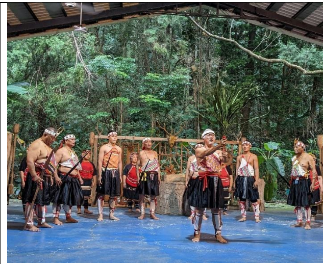
Bunun Tribe Dance