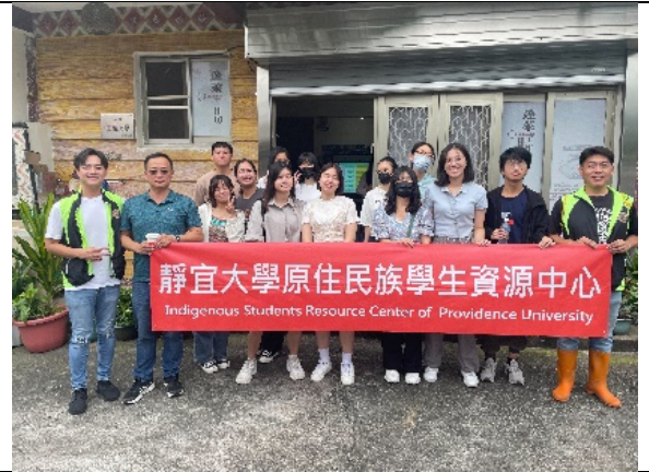
Saisiyat Tribe Rattan Weaving Crafts