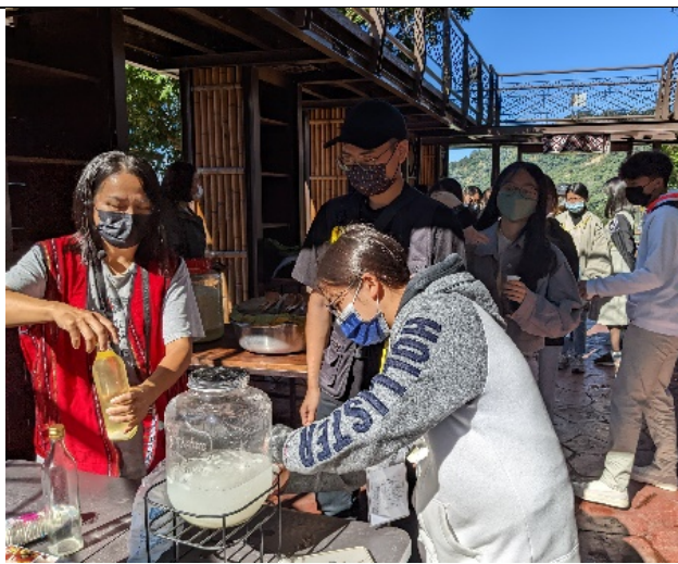
Indigenous Cuisine : Atayal Tribe Millet Wine