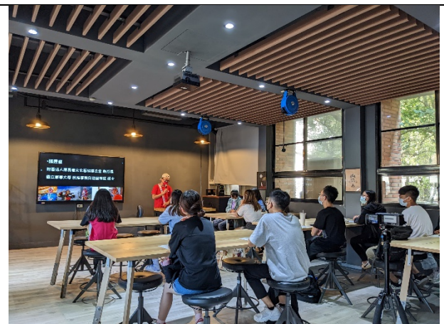
The Formosa Indigenous Dance Foundation of Cultural and Arts introduces Indigenous musical and dance culture through the study of digital songs and traditional dances of the Hla'alua people.