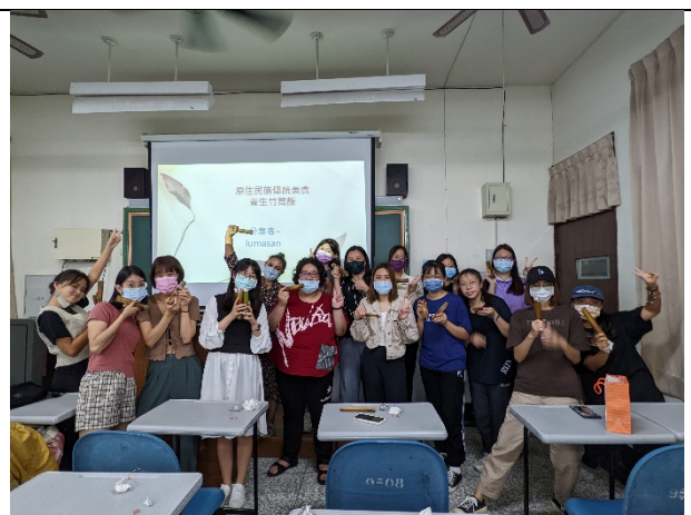
Indigenous Culinary Culture Seminar