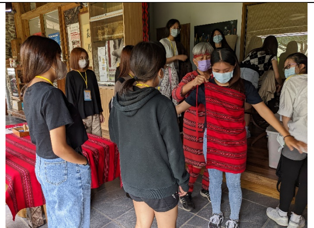
The Seediq Traditional Clothing Experience