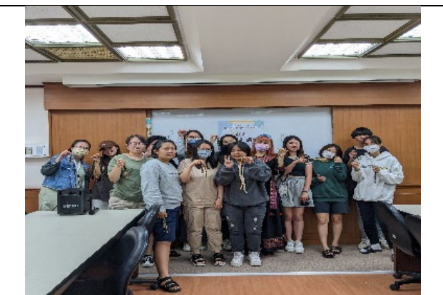
Introducing the Bunun Tribe Festival Calendar