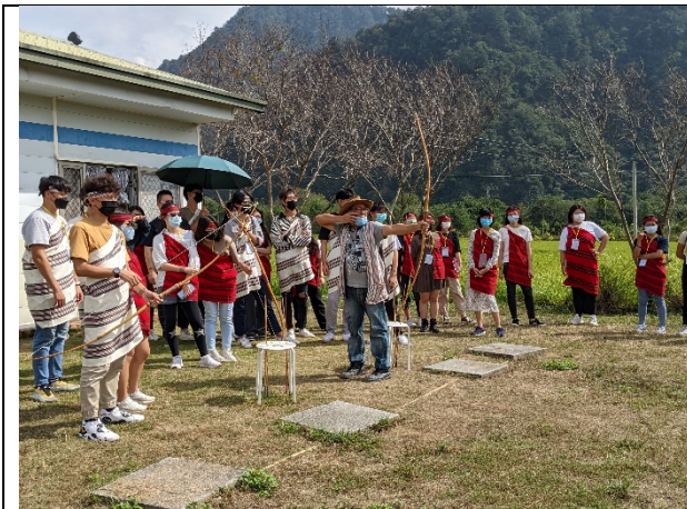
The Seediq Archery Experience