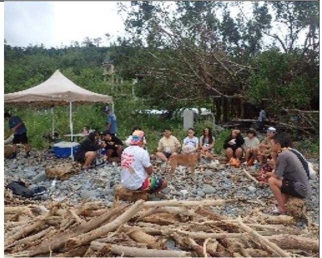
Amis Tribe Maritime Lifestyle Experience and Ocean Education