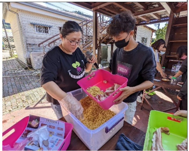
Indigenous Cuisine : Atayal Tribe Cured Meat