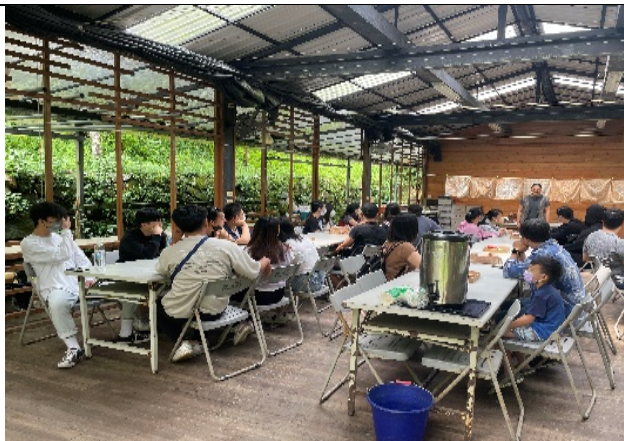
Introduction to Indigenous Dyeing and Weaving Techniques, Materials, and Clothing Production